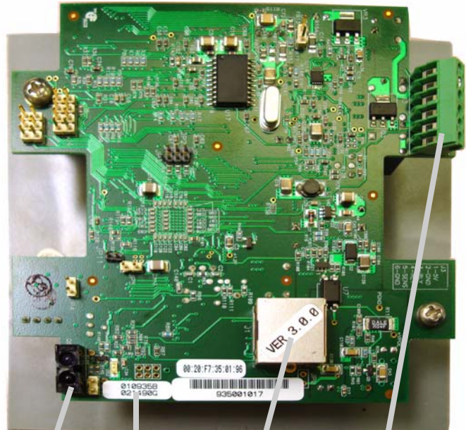
010935B Hardware Version (Firmware Version 3.0.0 and above)

Intrusion Detector Header 010935B or above Version 3.0.0 Firmware Label 6 Post Header